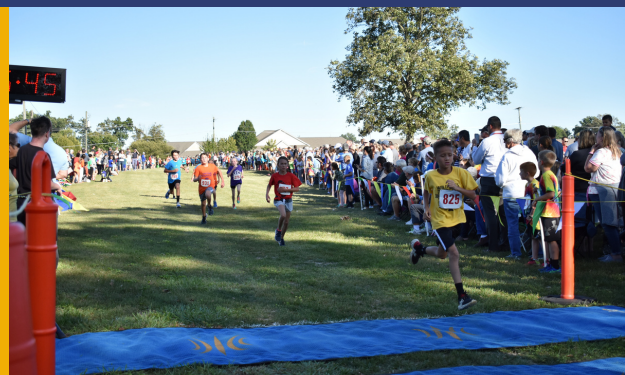
Perry Hill's Cougar Chase

Check with your school for more information.