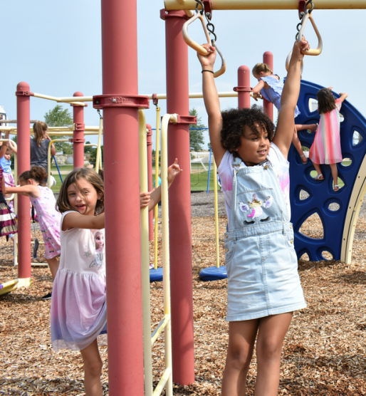
Recess at Perry Hill Elementary